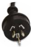
10 Amp power

The Australian Made Cameo self-contained have been designed for the testing demands of busy venues to operate efficiently, to maintain temperature as products are taken out, stock replenished and doors continually opened and closed. The units are available in one to four door counters, manufactured in stainless steel or hardwearing black coated steel. Glass door units with LED lighting ensure an attractive display, while adjustable shelves enable different sized bottles and cans to be stored efficiently.