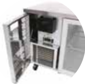
Removable refrigeration cassette