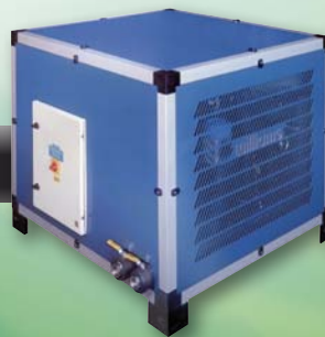
The Williams Glycol Secondary Refrigeration System