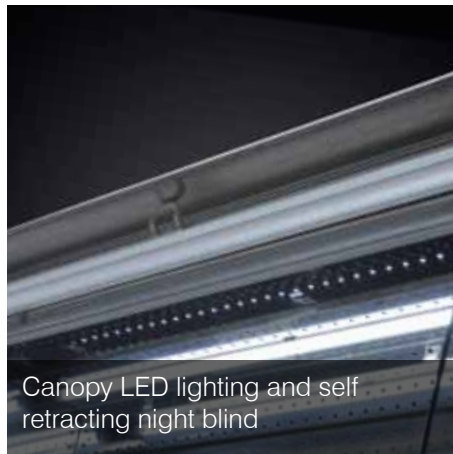
Canopy LED lighting and self retracting night blind