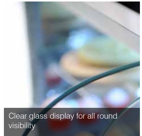
Clear glass display for all round visibility